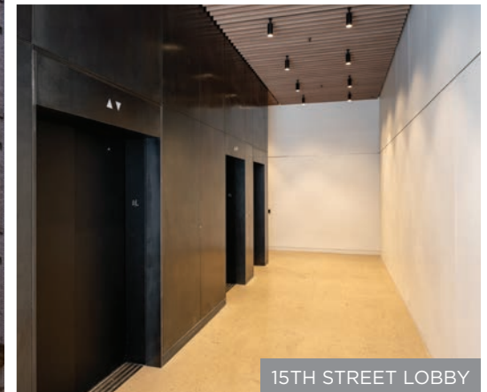
15TH STREET LOBBY