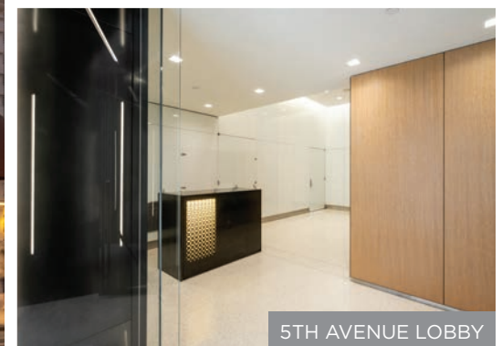
5TH AVENUE LOBBY