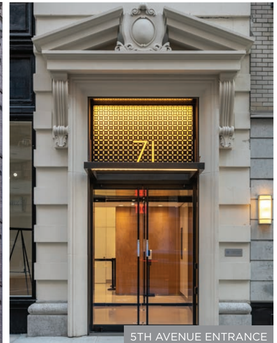
5TH AVENUE ENTRANCE

STRONG, WELL-CAPITALIZED OWNERSHIP AND HIGH-END TENANT ROSTER THROUGHOUT THE BUILDING INCLUDING ADYEN, FORRESTER RESEARCH, AND NEW SCHOOL